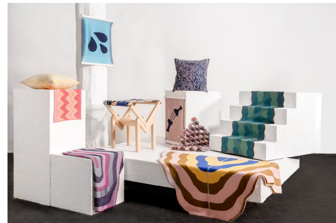
Goran Sidjimovski presented a collection of home textiles knitted from dead-stock yarns and recycled polyester.

For Alcova, Atelier LUMA constructed an inviting wool tent where a working felt machine invited you to consider alternate uses for the underloved textile. The studio also presented delectable floor pillows woven from palm leaves—perfect for any beachside escape, with more thought injected into them than immediately meets the eye. Purely frivolous design wasn't ignored though. In Alcova's Budapest pavilion, a "Frozen Textile" chair was presented by Demeter Fogarasi with a burlap-adjacent material floating confusingly in space. To create the chair, several layers of a jute-based biocomposite developed with Meshlin Composites were heat-pressed together to form a stronger material, which is then draped over a metal frame devoid of a solid seat or back, and "frozen" in a comfortable, sittable form. The resulting form is inviting, fanciful, and more comfortable than expected.