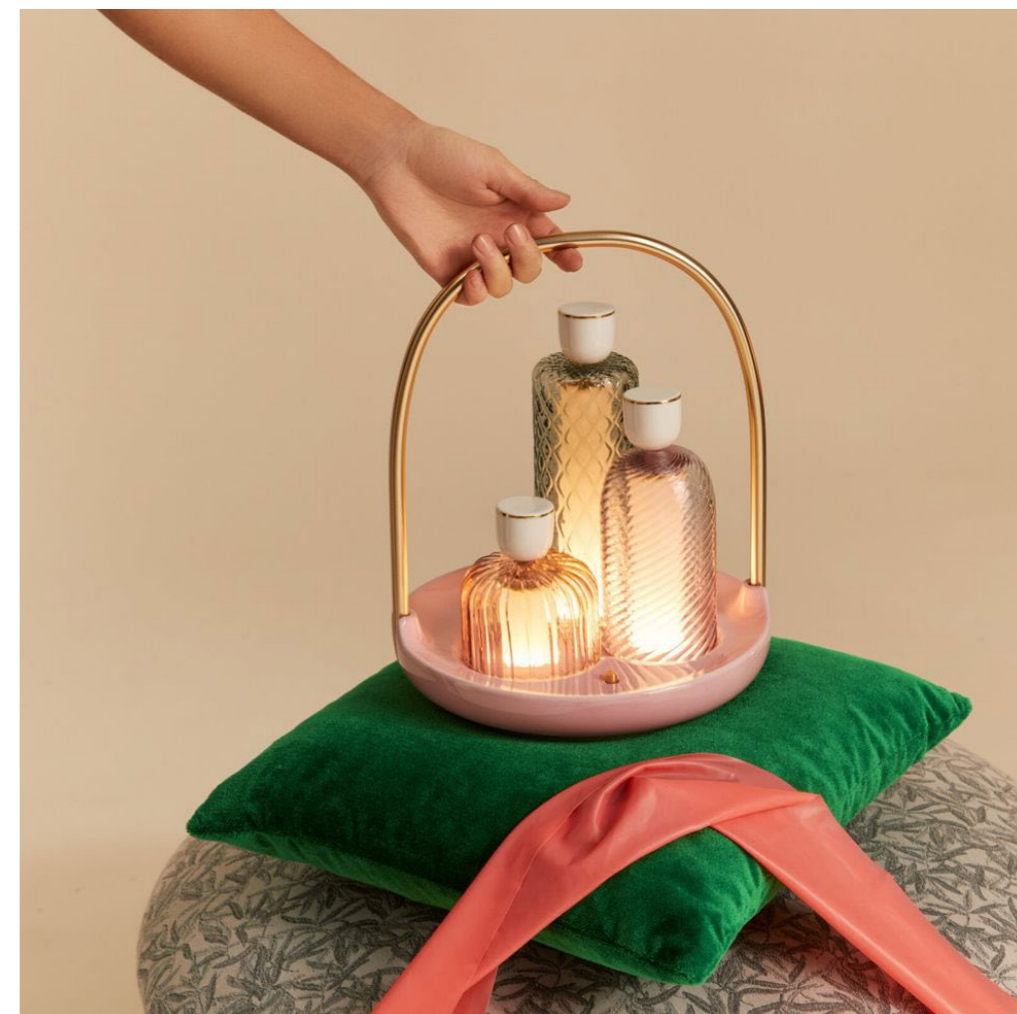
Ginori's sweet perfume bottle-inspired lighting.