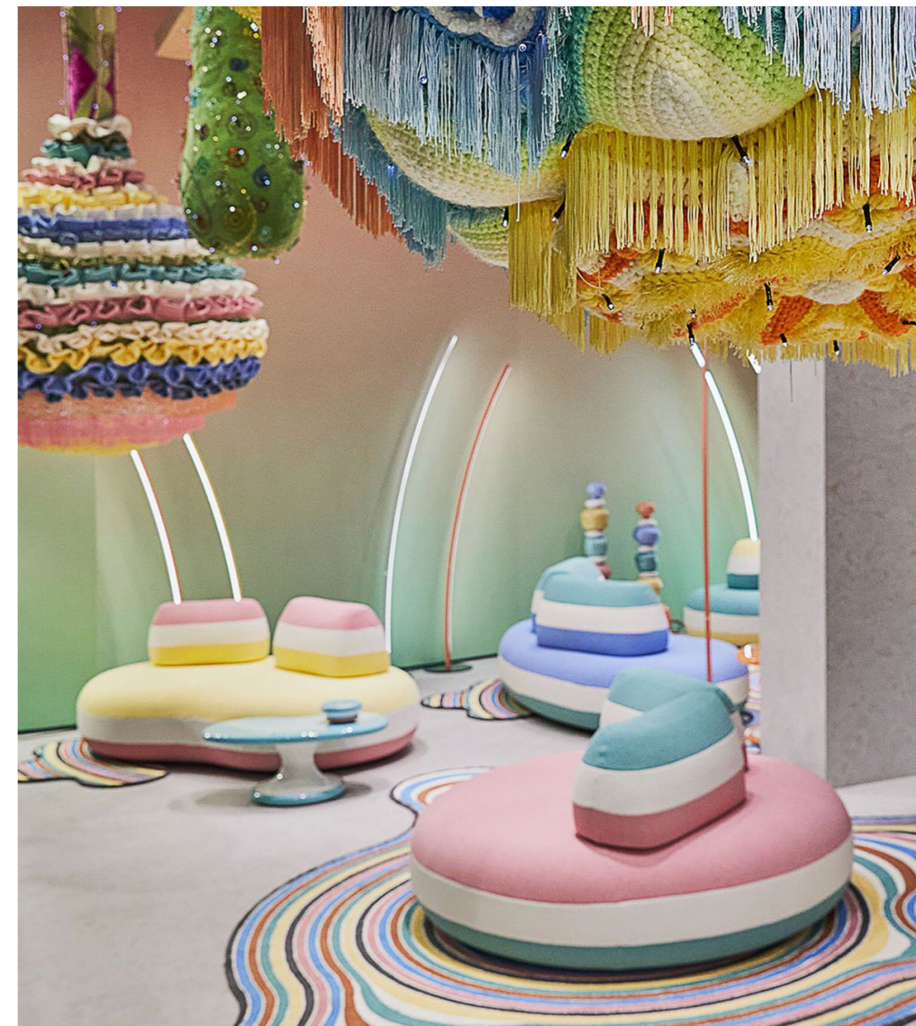
Joana Vasconcelos unveiled a new indoor/outdoor edition of her famous BomBom chairs for Roche Bobois.

If 2020 marks the year that everyone embraced outdoor living, then 2023 is the year that painted said outdoors blue, yellow, pink, and just about every technicolor hue in between. Outdoor furniture, long a category defined by neutral hues and the occasional pop of green, has finally embraced all that pastels and vibrants can offer. Perhaps the best example of this was at Roche Bobois, where artist Joana Vasconcelos unveiled a new indoor/outdoor edition of her famous BomBom chairs. Inspired by sunsets in her native Portugal, Vasconcelos's collection transformed the brand's showroom off Via Durini into a veritable Candyland of kaleidoscopic hues and paired the various colorful rugs, sofas, and tables with an equally topsy-turvy textile artwork hanging above. Meanwhile at the fairgrounds, Flexform added a dash of these pastels to its outdoor offerings via its Supermax Outdoor lounge chair. Dedon dipped its toes even further into the world of color by developing a new, color-shifting fiber for its sofas and lounge seating that combines contrasting hues like purple and orange.