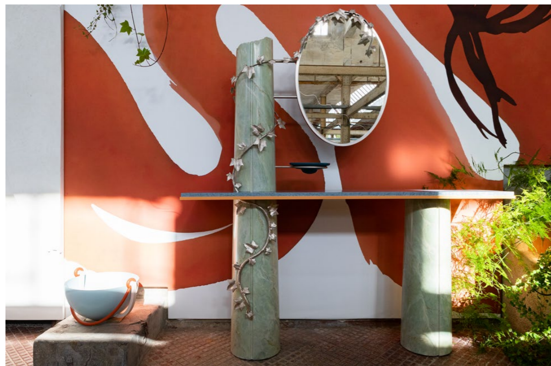
Rinck's faux-marble furnishings.